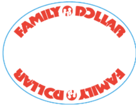
Anti-Peel Branded Oval "Theft Buster"

The label is made using a destructible material with an anti-peel adhesive.